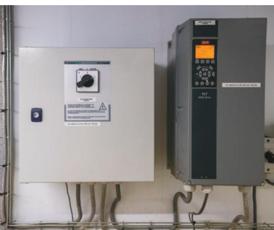
▲ A robust IP55-rated VLT® drive controls the Stienen climate solution equipment.

His combination of sustainable entrepreneurship and a genuine passion for pig farming has proved to be a successful model for how modern farms can be run in an increasingly competitive international market. In fact, his company, the Van Asten Group, now has six locations in Holland and Germany – with an annual turnover of 70 million Euros.