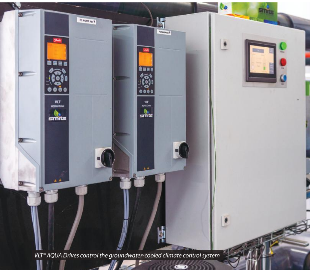
VLT® AQUA Drives control the groundwater-cooled climate control system

– Erwin Stienen, CEO, Stienen Bedrijfslektronica B.V.