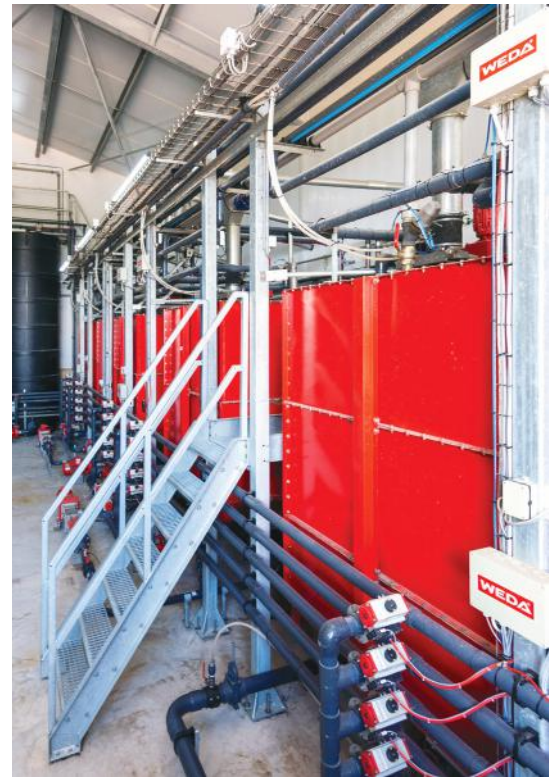
▲ Weda fermented wet feeding system