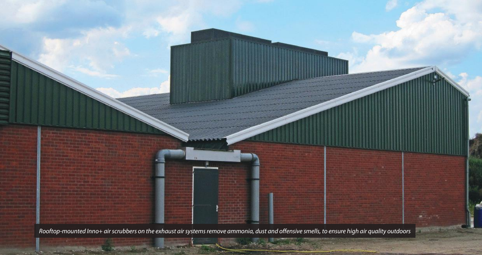
Rooftop-mounted Inno+ air scrubbers on the exhaust air systems remove ammonia, dust and offensive smells, to ensure high air quality outdoors